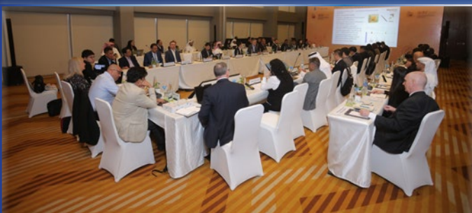
34 th ACI APAC & MID RASC meeting in Delhi

By doing so, future airport operations can be more effective, cost-efficient, and resilient, reducing the need for disruptive retrofits. Additionally, ACI APAC & MID have extensively advocated for state regulators to adopt a balanced approach to technology deployment at airports, cautioning against prioritizing checkpoint technologies at the expense of other critical security areas, which are vital for overall security and efficiency.