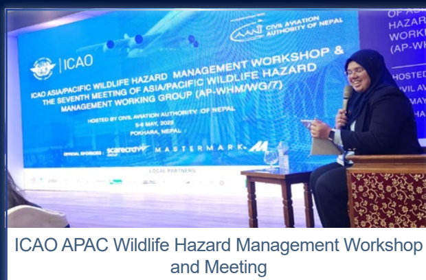
ICAO APAC Wildlife Hazard Management Workshop and Meeting