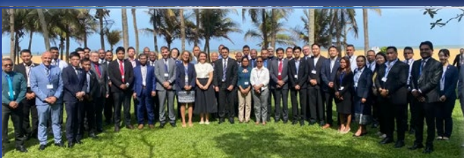
ACI's engagement in capacity building workshops organized by ECAC, ACAO and AFCAC in Riyadh and Colombo

Moreover, for the first time ever, the regional office was invited as a guest speaker to the security committee meeting of the Association of Asia Pacific Airlines (AAPA) in Kuala Lumpur to share airports' security priorities to the airline community. The two associations agreed to collaborate further in 2027 to advocate topics that are of common interest to both airports and airlines at the regional level.