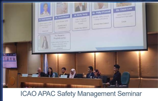
ICAO APAC Safety Management Seminar