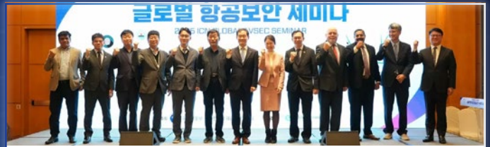
2025 Global Aviation Security Seminar hosted by Incheon Airport in Seoul

Also, throughout 2025, ACI APAC & MID collaborated with various regional associations to assist small and less developed airports to improve security. For example, the regional office engaged with European Civil Aviation Conference (ECAC), the Arab Civil Aviation Organization (ACAO) and the African Civil Aviation Commission (AFCAC) in organizing technical workshops in Riyadh, Morocco and Colombo over the year. These three workshops in total attracted over 300 security professionals from state regulators, airports, airlines, and other stakeholders.