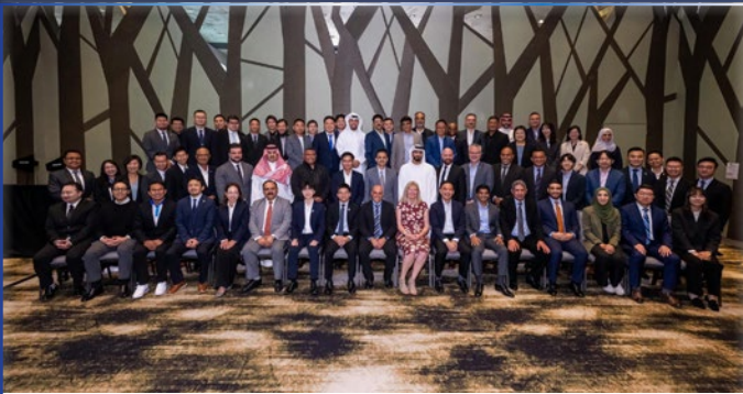
35 th ACI APAC & MID RASC meeting in Singapore

This year, the RASC held two meetings in May in Delhi and in November in Singapore both of which saw record-breaking attendance from airports and World Business Partners (WBP). This high turnout underscores the importance of advancing aviation security in the region.