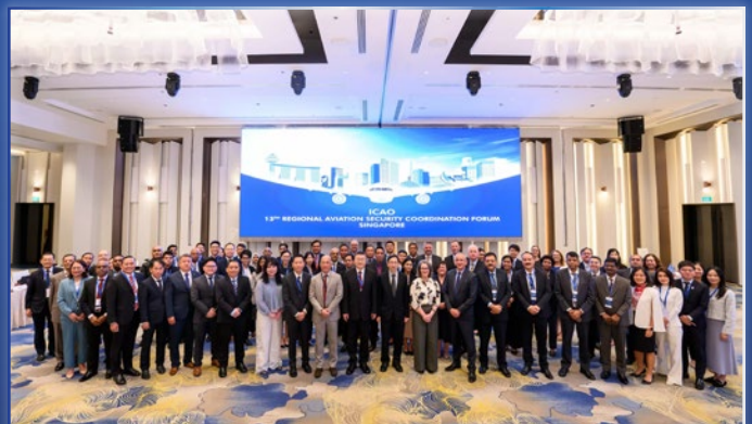
13 th ICAO APAC Regional Aviation Security Coordination Forum in Singapore