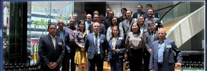
ACI APAC & MID at the AAPA's security meeting for airlines in Kuala Lumpur

Apart from advocacy, capacity building is a key priority for the region. A 3-hour workshop on aviation security was conducted as part of the agenda of the ACI Airport Day in Auckland, New Zealand in September. The workshop was specially designed for small and regional airports and well attended by over 60 participants from the airports in New Zealand and the Pacific Islands.