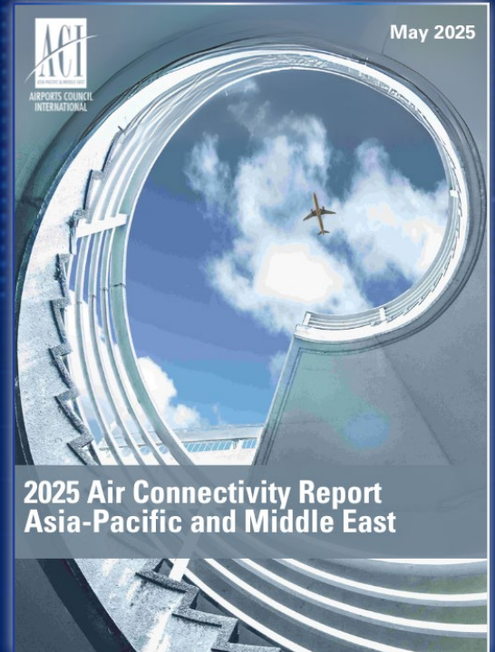
2025 Air Connectivity Report Asia-Pacific and Middle East

The Department continued advancing analytical inputs related to enhanced aviation market integration within the GCC, including risk framing and airport-level impact considerations. The policy logic remained anchored in measurable economic gains from harmonisation initiatives, including facilitation improvements, interoperability measures, and more integrated market outcomes, with connectivity positioned as both an aviation objective and a broader competitiveness instrument.