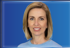
CARRIE HURIHANGANUI CEO, Auckland International Airport Limited, New Zealand