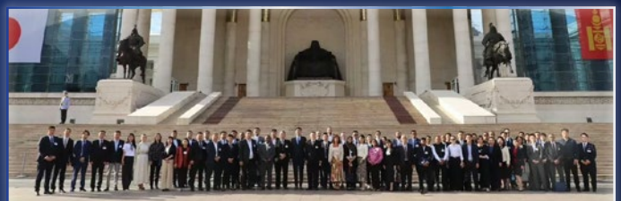
ICAO APAC Regional Facilitation Forum in Ulaanbaatar