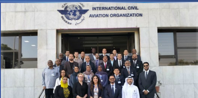
ICAO MID Awareness Seminar on the Global Aviation Security Plan in Cairo

Over the year, the regional office also worked closer with individual airport members in support of their security initiatives. ACI APAC & MID was invited to speak at the 2025 Global Aviation Security Seminar, hosted by Incheon International Airport Corporation (IIAC) in November in Seoul, to share insights on the future trends of aviation security development and ways in addressing current challenges in operations. The seminar saw participation from over 100 participants from government bodies, airports, academia, and airlines.