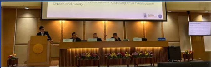
Inaugural ICAO APAC Regional Seminar on Aviation Cybersecurity in Bangkok