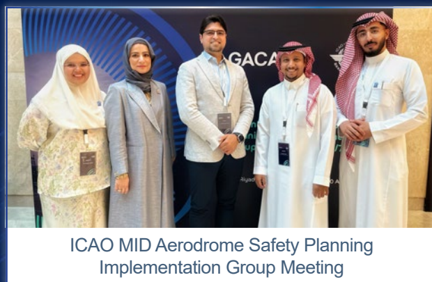
ICAO MID Aerodrome Safety Planning Implementation Group Meeting