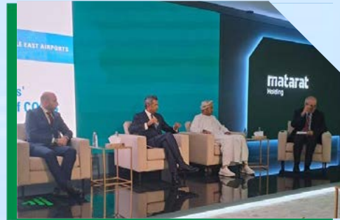
We also had an insightful discussion on Climate Change and how Middle East Airports are addressing the challenge.