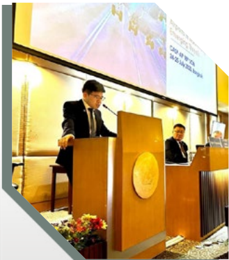
The ICAO Asia-Pacific CAPSCA-AP meeting in Bangkok