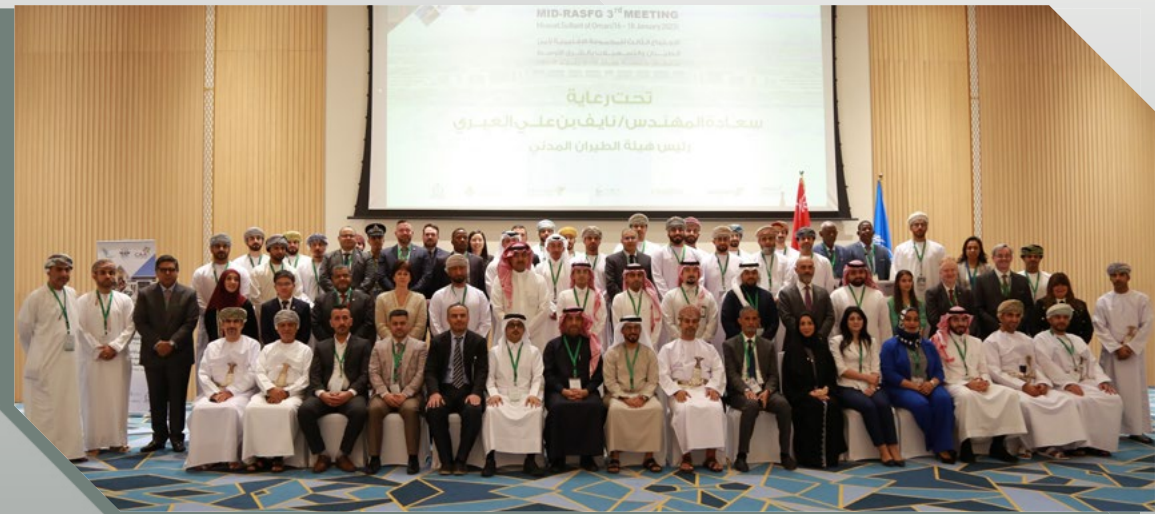
The ICAO MID RASFG meeting in Muscat