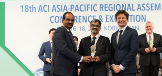
Kempegowda International Airport 15-35 mppa Platinum