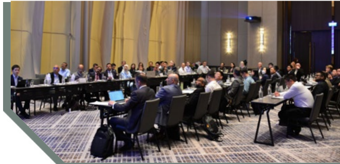
31 st ACI Asia-Pacific & Middle East RASC meeting in Bangkok

Besides, the RASC published a guidance document to provide practical examples that can make airport security operations more sustainable from environmental, social, and economic perspectives. The document aims to assist airport security managers in considering ways in which the security function can actively contribute to the broader sustainability objectives of the airport, without compromising security performance and compliance.