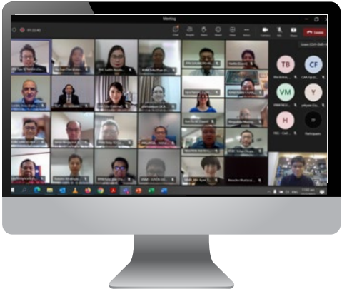
The 11 th Asia Pacific Aviation Security HOR meeting

In the area of facilitation, despite the subsidence of the pandemic, ACI Asia-Pacific & Middle East continued to see the importance of engaging policy makers both in the civil aviation and public health sectors to improve preparedness planning and response to public health events in the future. For example, ACI Asia-Pacific & Middle East participated at the ICAO joint Europe and Middle East 10th meeting of the Collaborative Arrangement for the Prevention and Management of Public Health Events in Civil Aviation (CAPSCA EUR-MID/10) in Bahrain to propose a number of recommendations that could help the industry better prepare for future pandemics, including the introduction of universally accepted digital health credentials.