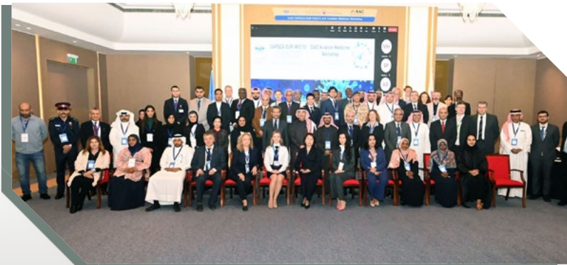
The ICAO CAPSCA EUR-MID/10 in Bahrain