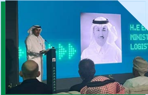
H.E Saleh bin Nasser Al-Jasser, Ministry of Transport and Logistic Services, Kingdom of Saudi Arabia, delivering the key note.