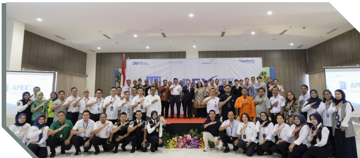
APEX in Security review in Yogyakarta

ACI Asia-Pacific & Middle East continues to put great emphasis on capacity building in aviation security by providing technical assistance to airports in need. As the region started to emerge from the COVID-19 pandemic, a number of APEX in Security reviews were physically conducted within the region in 2023, including the two reviews at Yogyakarta International Airport (YIA) and Lombok International Airport (LOP), hosted by PT Angkasa Pura I as well as one review at Tan Son Nhat International Airport (SGN), hosted by Airports Corporation of Vietnam (ACV). APEX in Security is a peer-to-peer assessment that aims to help airports improve compliance with ICAO regulations and increase adoption of international best practices. Over 40 APEX in Security reviews have already been conducted globally since its launch in 2017.