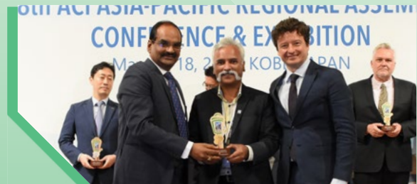
Hyderabad International Airport 15-35 mppa Platinum