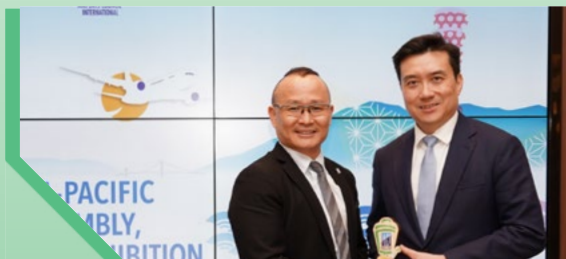
Hong Kong International Airport Over 35 mppa Gold