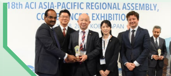
Central Japan International Airport 8-15 mppa Platinum