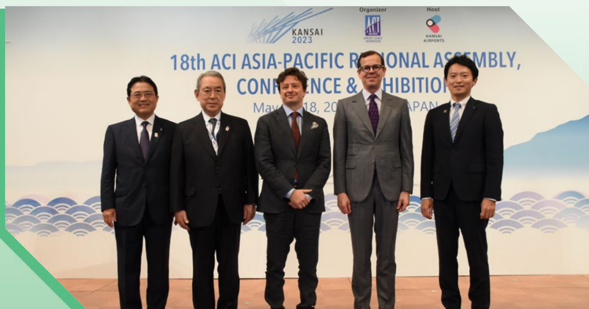
GAR 2023 Award Ceremony

In 2023, a notable cohort of 30 airports that have publicly declared their commitment, taken strategic actions, or developed roadmaps toward this objective. These airports demonstrated a strong commitment to sustainability by obtaining various accreditation levels in Airport Carbon Accreditation, signifying their dedication to reducing carbon emissions throughout their operations. The ACI APAC & MID continued advocating and sharing airports decarbonisation efforts in meetings of ICAO Asia-Pacific, ICAO Middle East,