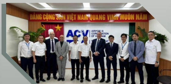
APEX in Security review in Ho Chi Minh City

Last but not least, the regional office was invited to speak at a number of security events in 2023, organised by key stakeholders in the region, such as the virtual 11th Asia Pacific Aviation Security Heads of Regulators (HOR) meeting, co-hosted by Singapore and Japan. Taking the opportunity, ACI Asia-Pacific & Middle East delivered a presentation to emphasise human-related difficulties in airport security, and urged regional