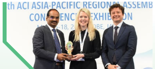
Christchurch International Airport Less than 8 mppa Gold

The seventh edition of GAR, themed “Elimination of Single-Use Plastic”, Chhatrapati Shivaji Maharaj International Airport, Kempegowda International Airport, Central Japan International Airport, and Mangaluru International Airport were recognised for their exceptional improvements and contribution to airport environmental sustainability