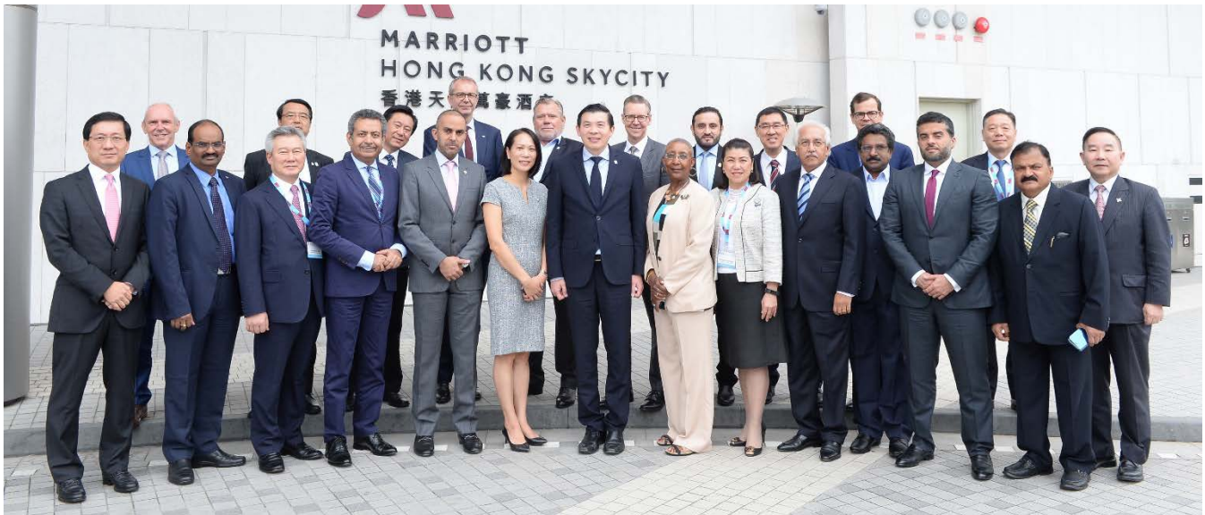
Board Members attending the Regional Board Meeting held in Hong Kong in April 2019.

The Regional Board is a governing body which determines the overall development strategy of ACI Asia-Pacific. The Board is composed of 25 aviation business leaders from across Asia-Pacific and the Middle East.