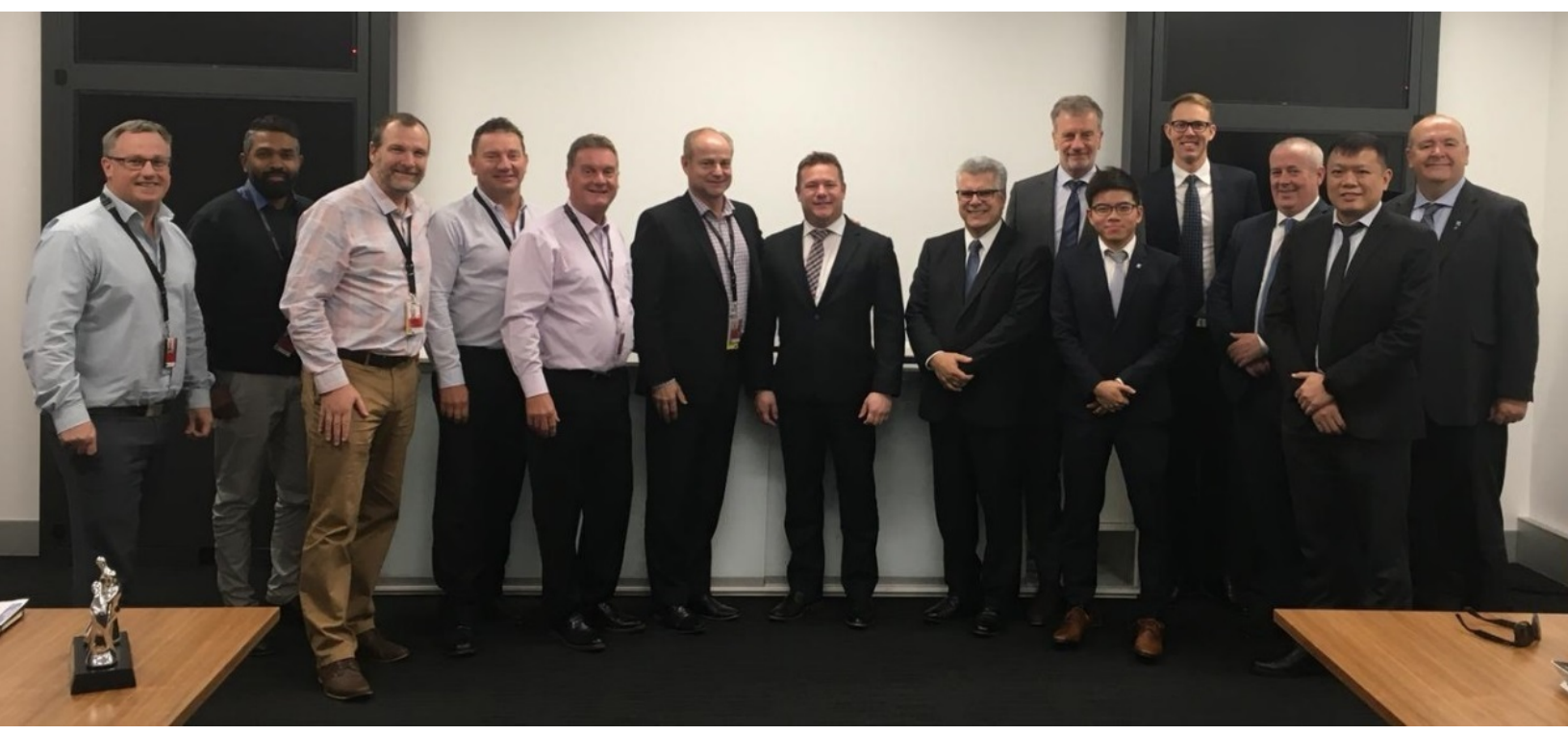
The team of security professionals taking part in the APEX in Security Review in May at Brisbane Airport

The first APEX in Security Review in Australia was conducted at Brisbane Airport from 27 – 31 May. The review team comprised of security experts from Changi, Dublin, Sydney airports and staff from the Regional Office and ACI World. After a week of review and discussions, a number of best practice recommendations were made by the team over the week to help enhance security measures at Brisbane Airport.