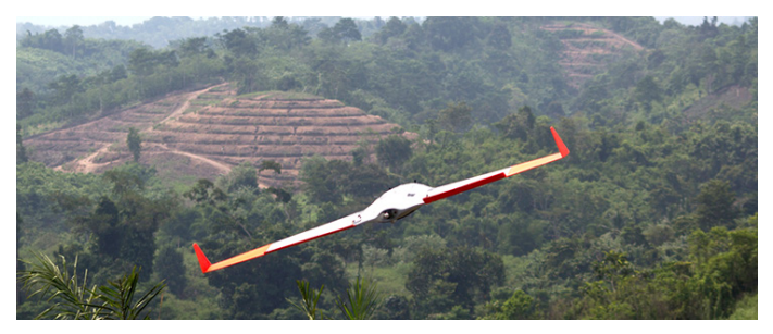
ICAO will be exploring these issues in depth at its fourth annual DRONE ENABLE event taking place this 9-11 September in Rio de Janeiro, Brazil.

Recognizing that an agreed global approach will greatly assist businesses and others in launching their UAS services without negatively impacting the safety of manned aviation operations, or the safety of persons and property on the ground,