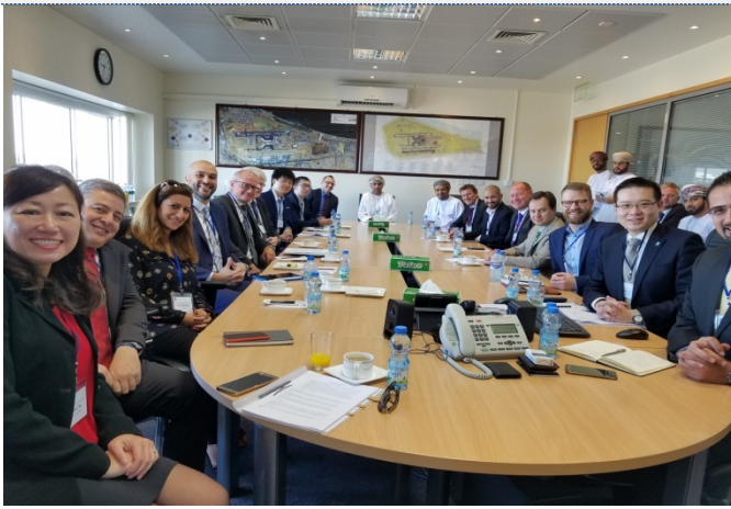
The group at Muscat – meeting with representatives from OAMC