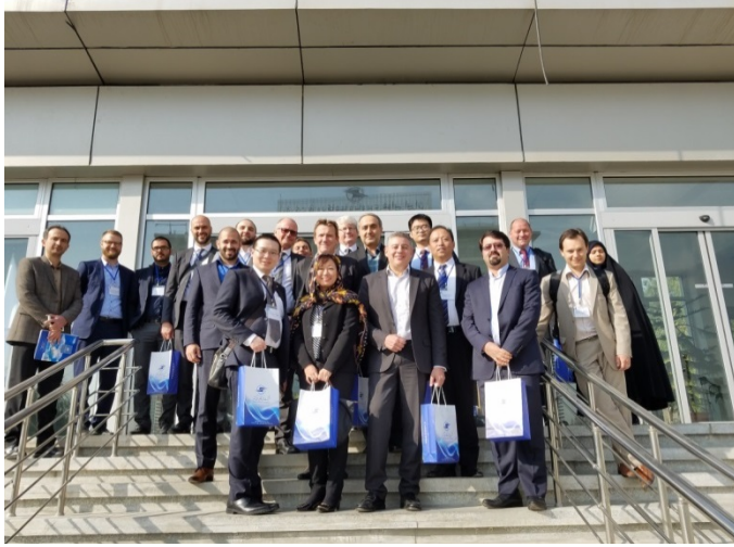
The group visited the Headquarter of Iran Airports Company